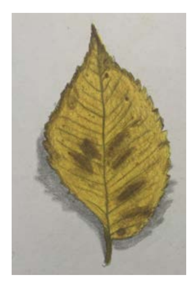
Creativity takes courage. by Henri Matisse